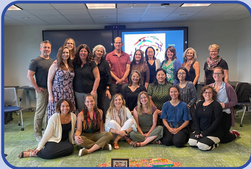
Attendees of the first Restorative Justice Research Community Gathering and Working Session at the Burlington, VT office of VLGS.

The NCORJ supports a community-driven, interdisciplinary approach to research that bridges the research-practice gap, empowers diverse voices, and grows the next generation of justice researchers.