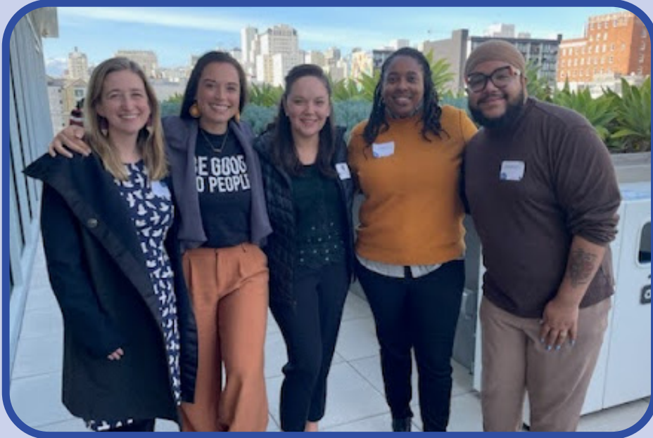
NCORJ team members at the Equitable Systems Design for Restorative Justice Institute at the University of California College of the Law, San Francisco

Expanding the implementation of restorative justice in the criminal justice context hinges on greater buy-in from 1) the general public to increase popular support for alternative approaches and 2) justice system actors, including police, judges, lawyers, and probation/diversion officers, who have the power to refer cases to restorative justice processes.