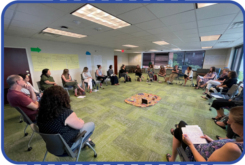
Attendees of the first Restorative Justice Research Community Gathering and Working Session in Burlington, VT.